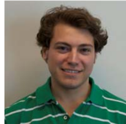
Conte , William Comm: 230 MB:074 Pager num: